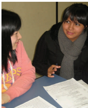
Mexican youth interview VanWest's Level 4 class in a custom spring program.