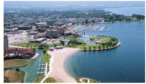
The resort city of Kelowna, just 400 km from Vancouver, offers a unique immersion experience for both students and working holidaymakers.

VanWest College regularly runs a Job Skills elective course where students learn about resumes, cover letters, interview techniques and how to find jobs. The school also assists students with getting a social insurance number - in fact, the government office where this is done is located right across the street from VanWest and getting